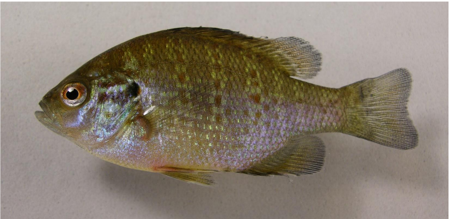
Juvenile Bluegill Sunfish ( Lepomis macrochirus ), approximately 70 mm fork length, sampled at the John Day Dam Smolt Facility on 5 August, 2024.