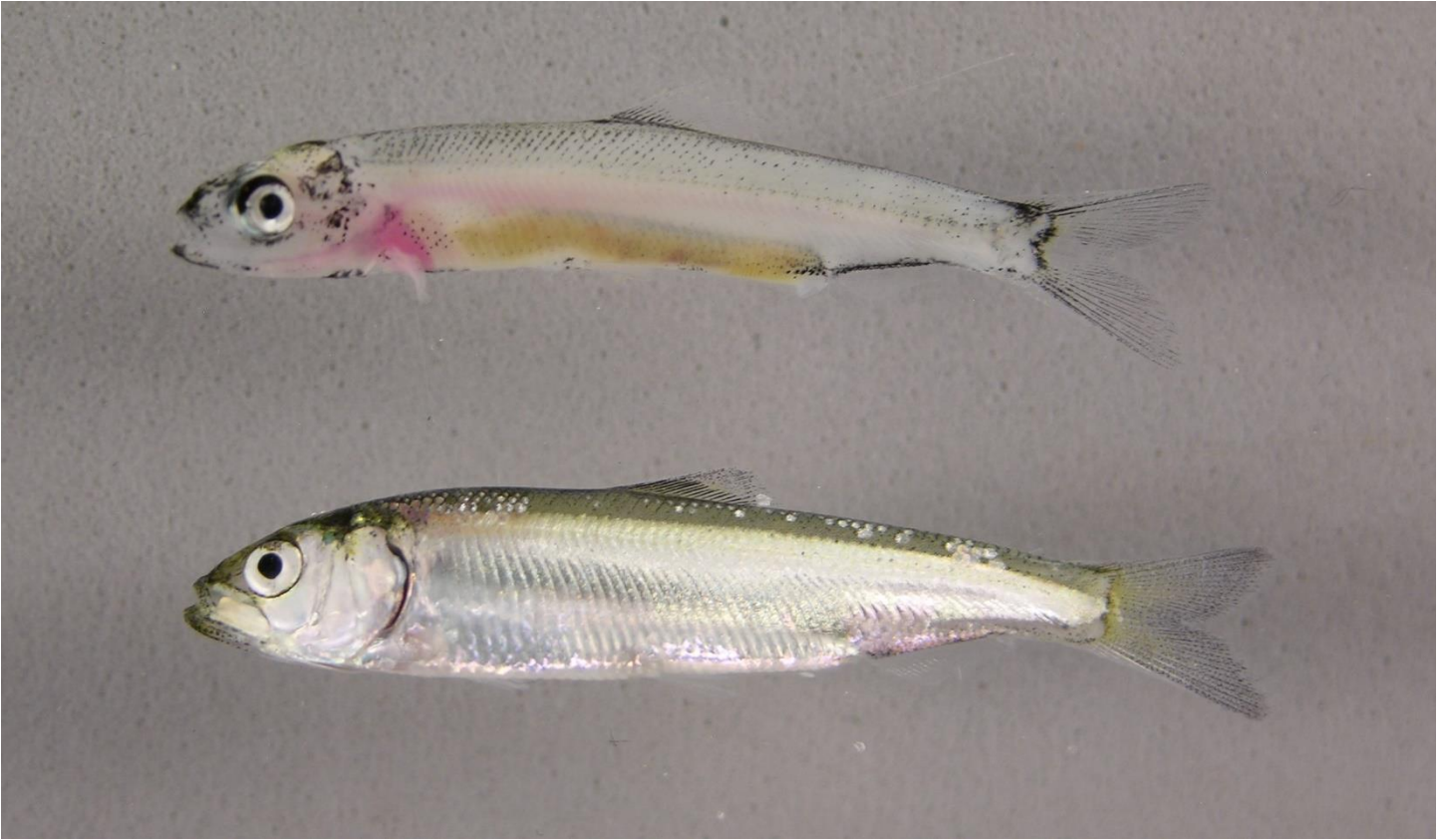
Juvenile American shad fry ( Alosa sapidissima ), approximately 40 mm total length, the specimen on top is rather unusual in that it has not grown scales yet whereas most of the fry this size already have scales like the specimen on the bottom, both sampled at the John Day Dam Smolt Facility on 1 August, 2024.